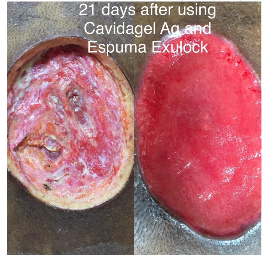
21 days after using Cavidagel Ag and Espuma Exulock