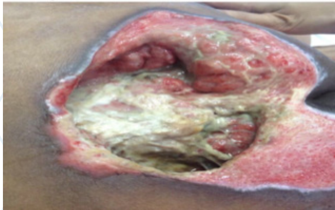
Day 3 (15/2/14)