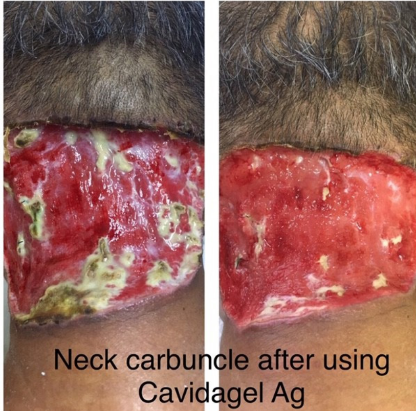
Neck carbuncle after using Cavidagel Ag