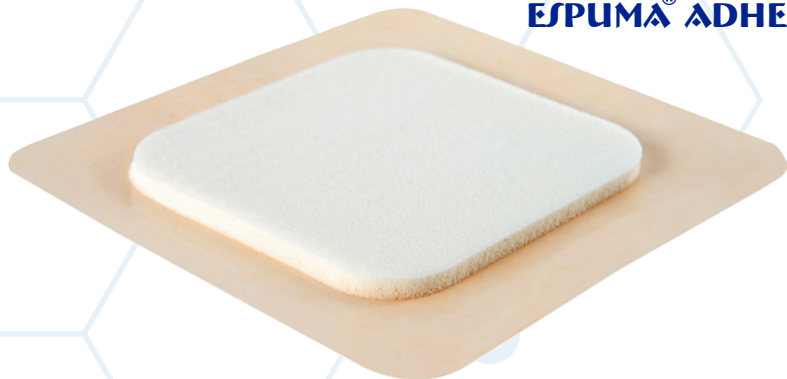
ESPUMA ® ADHESIVE